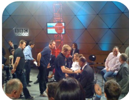
Participants and crew prepare for filming

The Weir Link is currently planning our own discussion group with guest speakers invited to lead and inspire discussions on a variety of topics that affect us all. Crèche, wine and nibbles will be provided so keep an eye on the notice board, or give us a call, for starting dates. Let us know if you have ideas for discussion topics or subjects you would be interested to learn